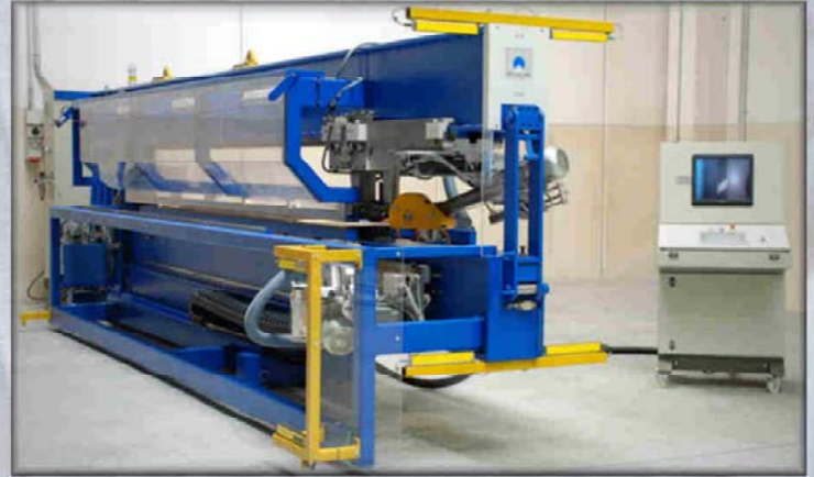
WELDINGS PLANISHING AND GRINDING MACHINES