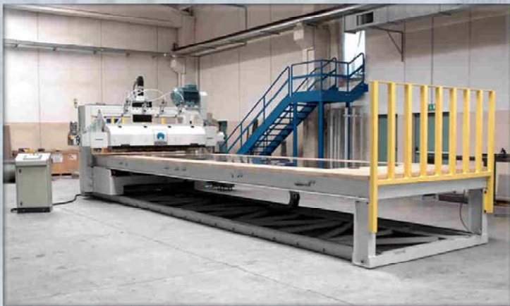
BUFFING AND MIRROR POLISHING MACHINES