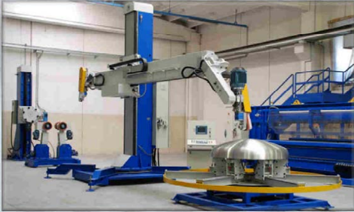
CNC VESSEL HEADS AND SHELLS GRINDING MACHINES